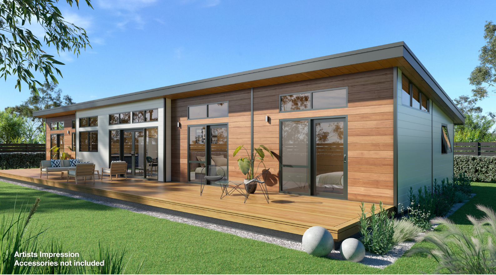
Artists Impression Accessories not included